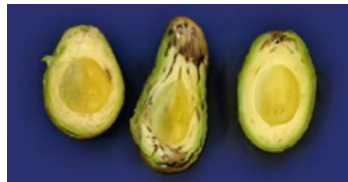
conventionally ripened avocado

Additionally, quality flaws on the inside of the fruit, such as discolouration of the fibres in the flesh described as “vascular browning”, can be significantly reduced using this new method. Following extensive testing with exceptionally positive results in multiple types of fruit.